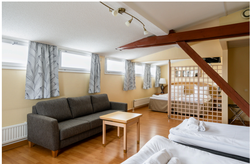
Family Room | Double Bed & 2 Single Beds