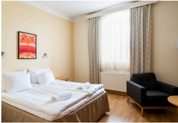
Standard room | Double bed