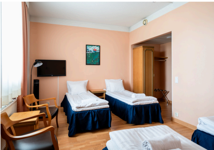
Standard Quadruple Room | 4 Single Beds

Pricing: Prices for individual bookings. For group or longer bookings, please request a separate quote. Availability of prices may be limited during major events, in which case the best price is with the code PAINUHIITEEN.