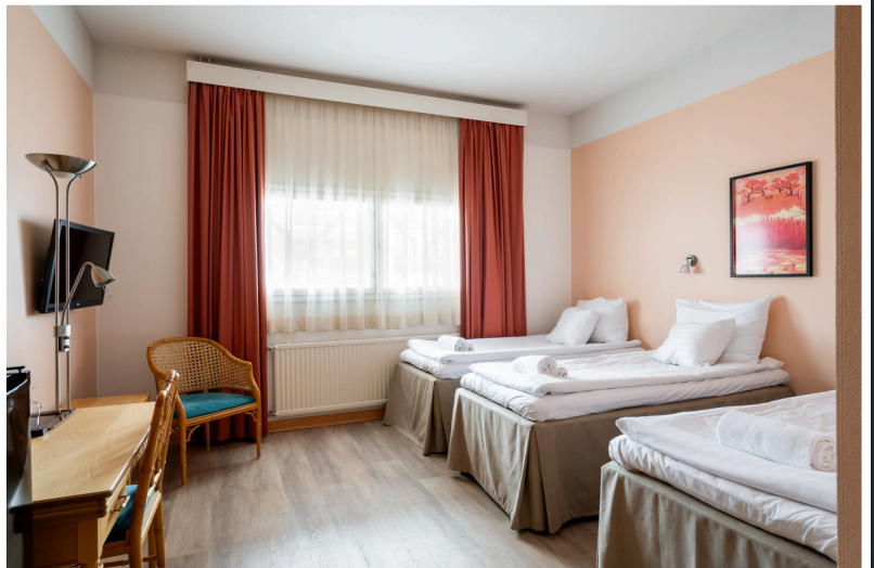
Standard Triple Room | 3 Single Beds